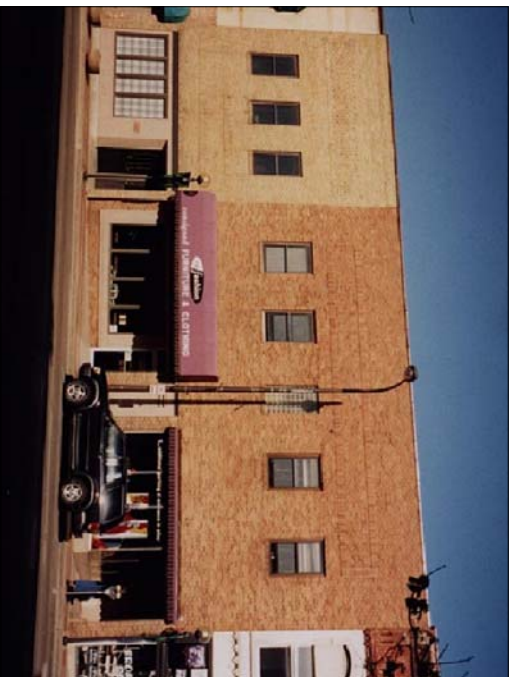
THE JLB APARTMENTS